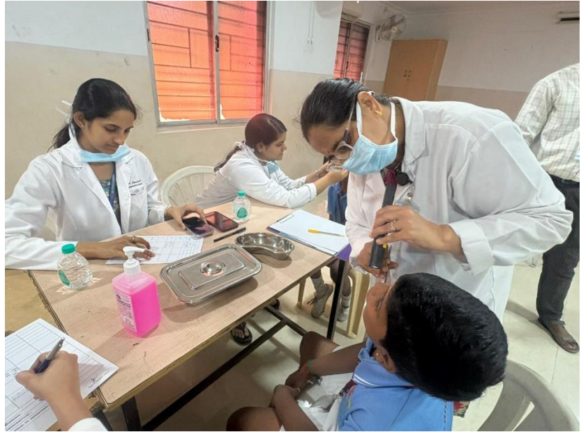
Session plan/Brochure/Document/Overall report of the activity* (image/pdf max 2MB)